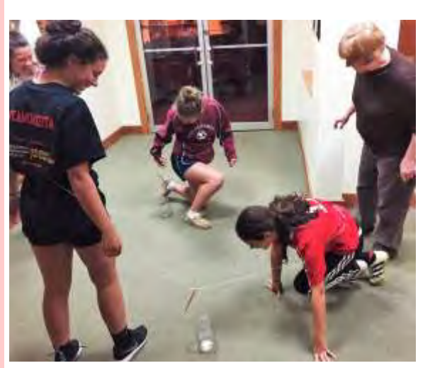
3<sup>rd</sup> Year Confirmation Fun