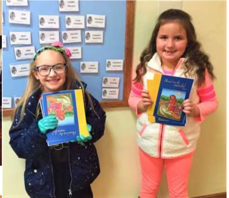
handing out bulletins,