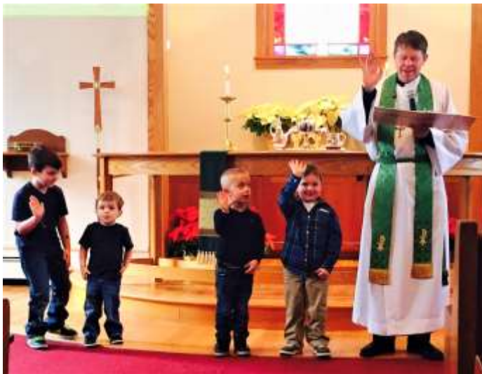
giving the blessing,