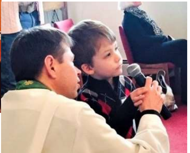
sending us out with the dismissal and in many other ways.