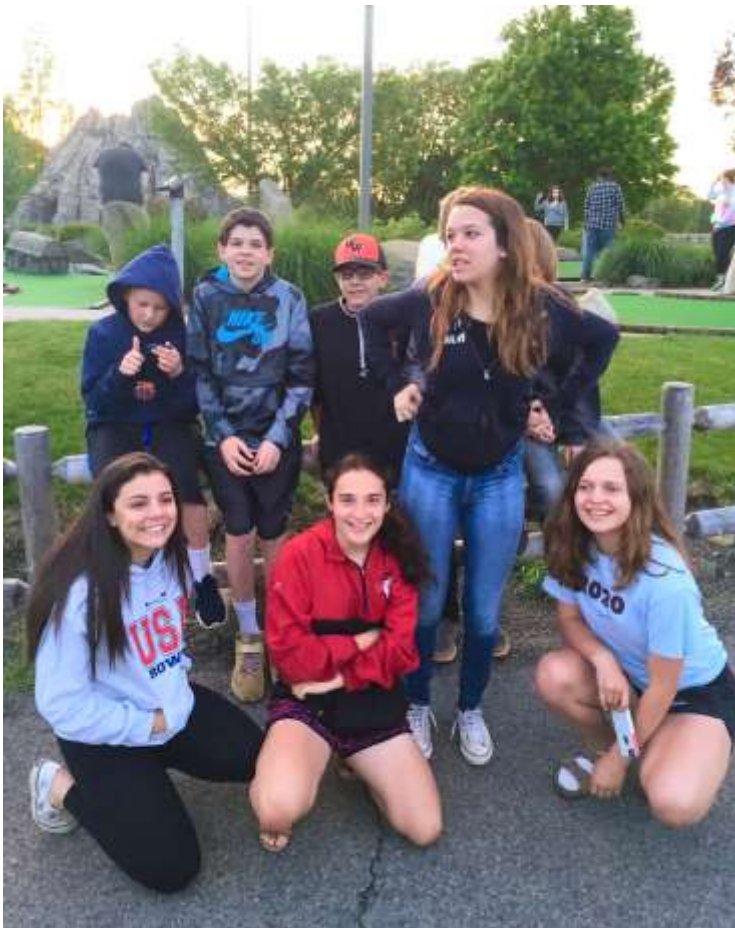
Playing miniature golf this June.