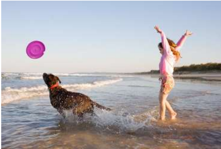
The Youth of Emanuel