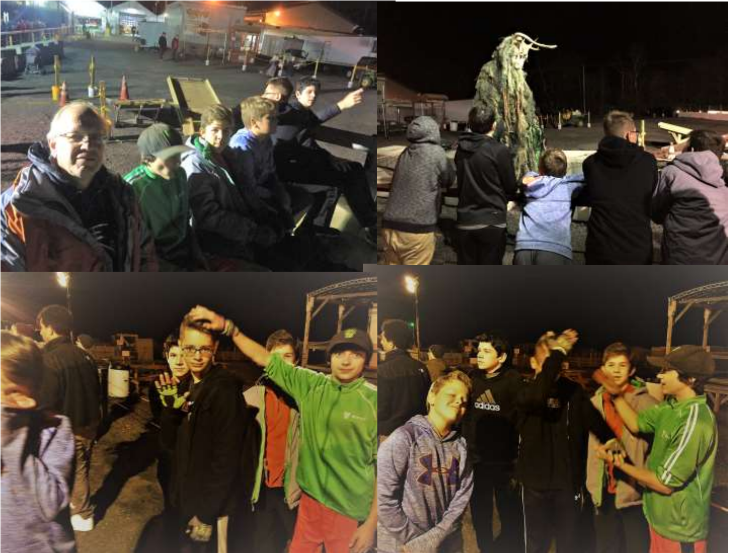
The youth of Emanuel for a night of fun & fright at Scary Acres this past October.