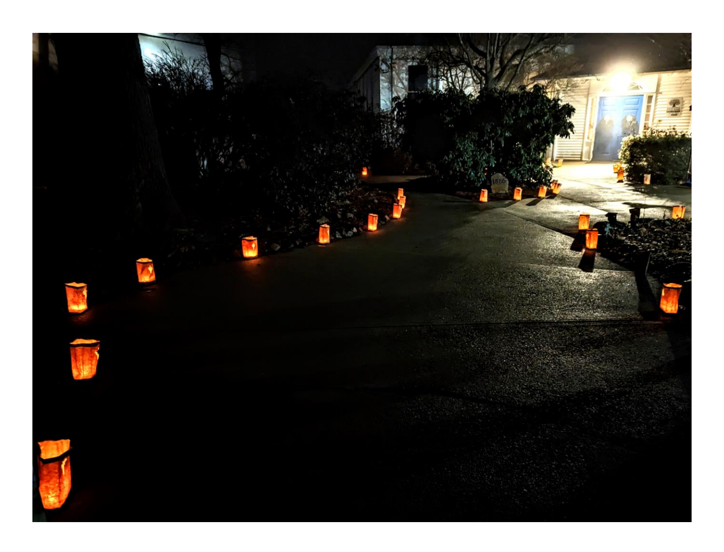
Late Night Service