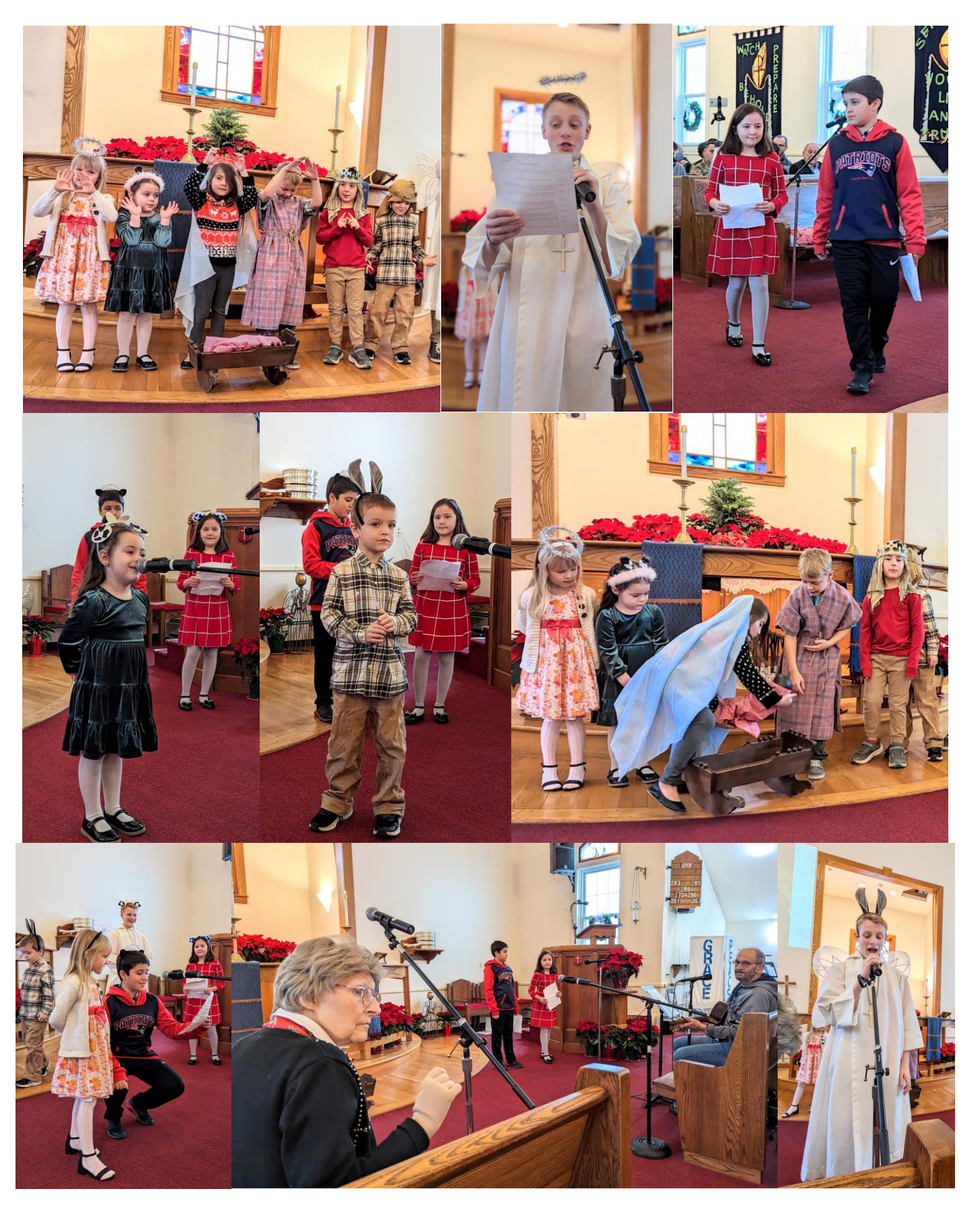
Thank you to all the Sunday school children and teachers for sharing the Christmas story!