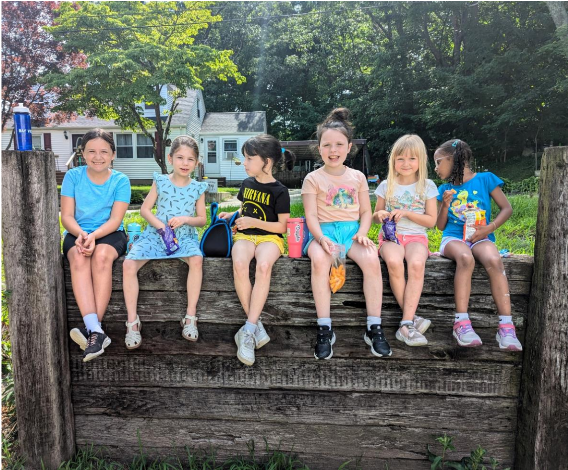
(retaining wall with kids on it)

Looking for a few good men (or women) to work on the retaining wall outside the fellowship Hall.