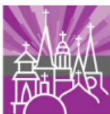
The Rhode Island State Council of Churches

Mathewson Street UMC Community Church of Providence Open Table of Christ UMC Chapel Street UCC (NEW!)