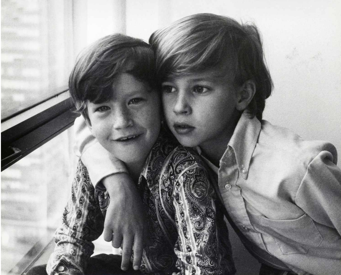
(Anderson Cooper and his older brother Carter)