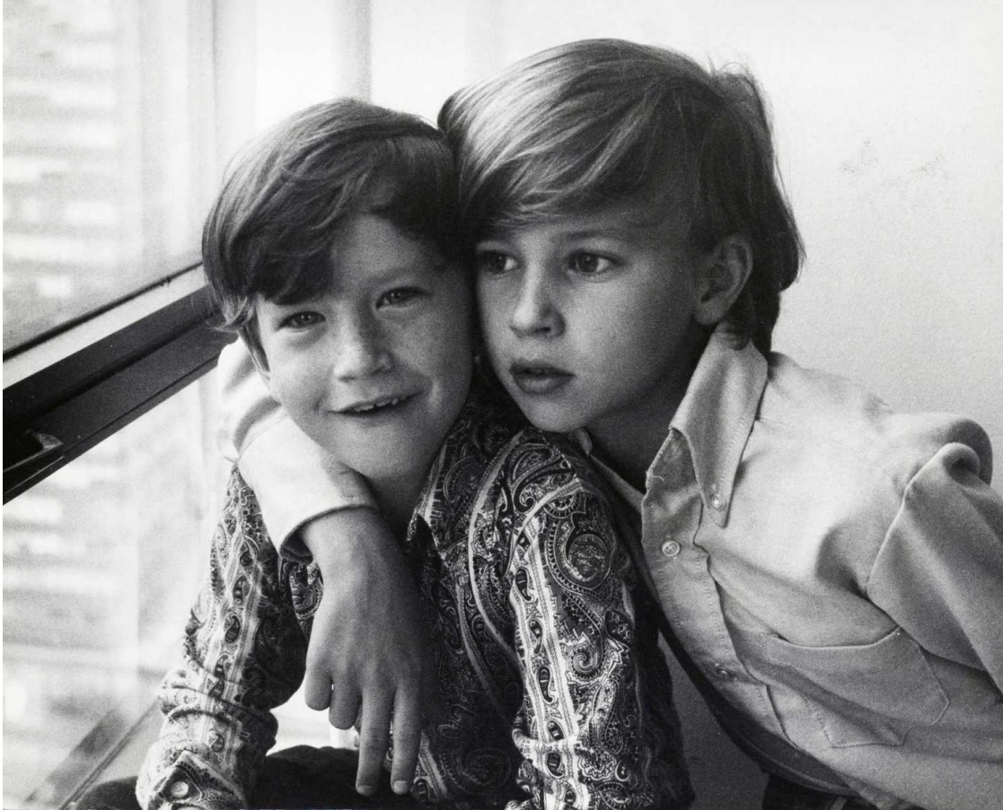
(Anderson Cooper and his older brother Carter)